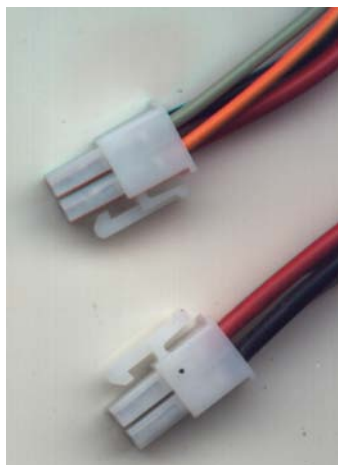
Figure 3 "Floating connector MiniFit 2x2"

This floating connector serves for connecting the supply (+12 V) and the communication wires (A B) to the control unit at the same time (see application note AS 0003)