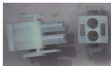
Figure 2 "Floating connector Mate-N-Lok 2x1"

This type of floating connector is used for connecting to the power supply communication wires (A and B) (see application note AS 0000) and for the connection of solar panels (see AS 0002) without using the external regulator.